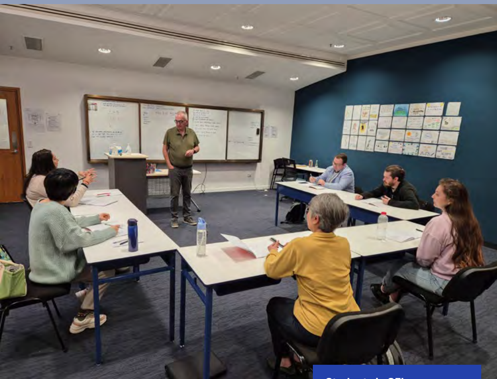
Students in SFI programme

Our domestic programmes focus on providing practical training and alternative education pathways to help individuals enhance their employability, academic performance, and personal growth. From workforce readiness through Skills for Industry (SFI) to tailored education support for students in Pūmanawa and the Study Support Centre (SSC), TII's programmes are designed to empower learners to achieve their full potential, supported by strong industry connections and a commitment to excellence.