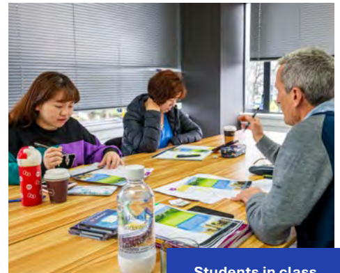
Students in class